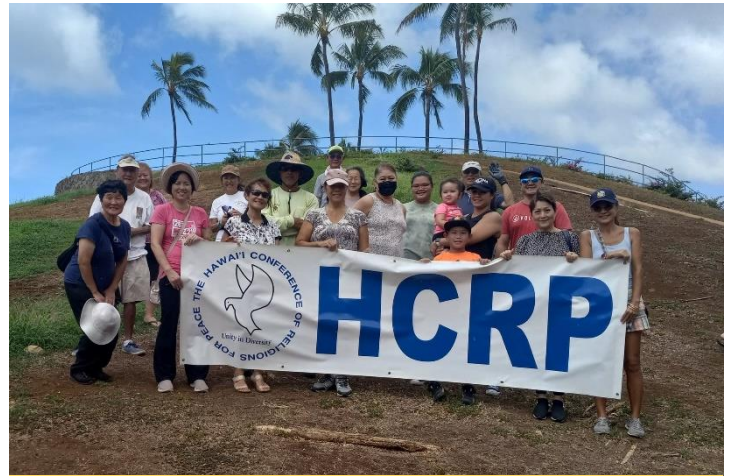
The HCRP held an annual clean-up at Kaka'ako Waterfront Park on Saturday, September 24th. Much Mahalo to the many people who were able to come out and help with the event, including the Ebime Kenjinkai Members.

1728 Liliha St. Honolulu, HI. 96817 Phone: 808-536-9078 Email: kmhcenter@konkomissionshawaii.org Website: http://konkomissionshawaii.org/