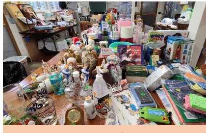
Garage Sale Success 9/17. We raised $776.95 to donate to the Headquarters!