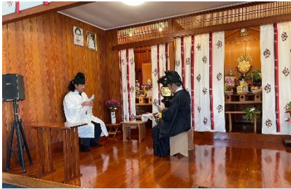
Autumn Memorial Service 9.25.22