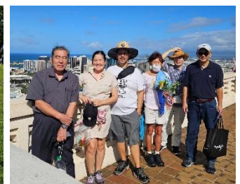
Memorial Day 2024: The Konko Missions in Hawaii ministers and members visited Punchbowl National Cemetery of the Pacific for the annual Memorial Day grave visitation and prayer. (May 26) Mahalo!