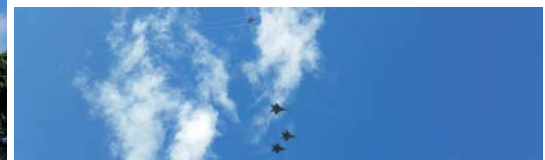
On Monday, May 30 th our KMH annual Memorial Day grave visitation took place at Punchbowl National Cemetery of the Pacific. At Punchbowl, we visited 28 graves and offered flowers and a prayer. In addition, we visited the Honolulu Memorial Park and Mililani Cemetery.