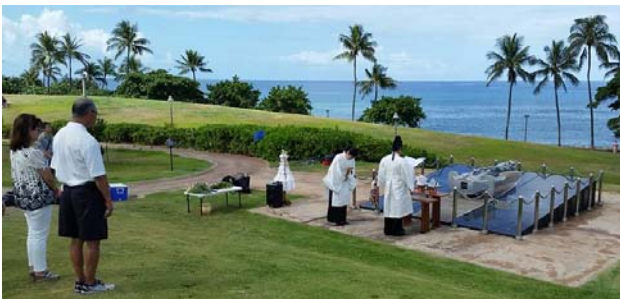
On Saturday, May 28, the Ebime Kenjinkai held the 2 nd annual Ebimemaru Memorial Service and Prayer for Ocean Safety at the Kakaako Waterfront Park Memorial.