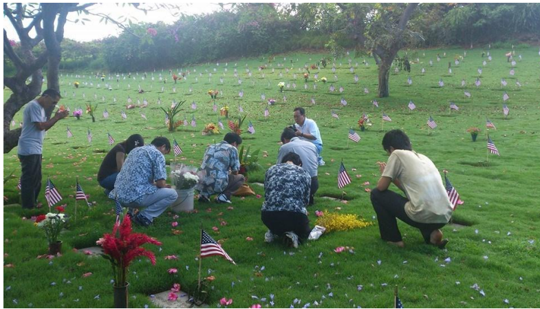
Memorial Day Grave visitation at Punchbowl, Nu'uuanu Cemetery and Mililani Cemetery