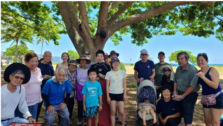
We held the KMH BBQ and Beach clean-up event on Saturday, June 11 th at Haleiwa Ali'i Beach Park. The beach was surprisingly clean! 22 people attended.