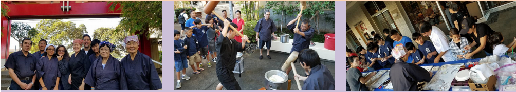
Sat, 12/16/2017: Mochitsuki demo at Japanese Cultural Ctr of Hawaii (Above)

Happy New Year 2018!!! 新年明けましておめでとうございます！