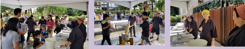
Wed, 12/27/2017: Mochitsuki demo at Hawaii Prince Hotel (Above)