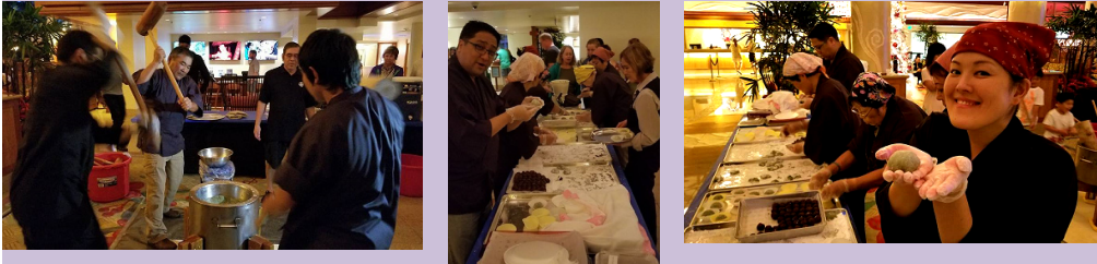
Tue, 12/26/2017: Mochitsuki demo at Hilton Waikiki Beach Hotel (Above)