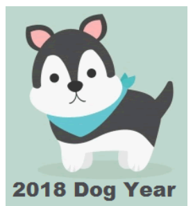
2018 Dog Year

The Chinese Horoscope 2018 predicts that this year of the Brown Earth Dog is going to be a good year in all respects, but it will also be an exhausting year. You will be happy, yet frustrated, rested, yet tired, cheerful, yet dull! ( thechinesezodiac.org )