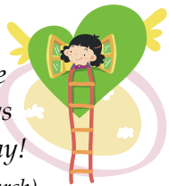
New Year's Party 2013 PICASSO SNAKE