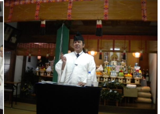
Above (L-R): Headquarters Main Worship Hall, 90th Anniversary of Iwatani Church, Sensei delivering the sermon.